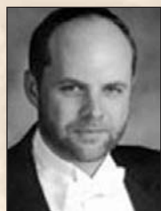
Stephen King Master Class

A veteran of the concert scene, she has had numerous collaborations with various symphonies, including The Boston Pops, National Symphony Orchestra, Chicago Symphony and the San Francisco Symphony. One of her proudest accomplishments was having the privilege to perform Bernstein's Candide at Lincoln Center with The New York Philharmonic. She was also featured at the Washington National Opera's 50th Anniversary Gala with Placido Domingo.