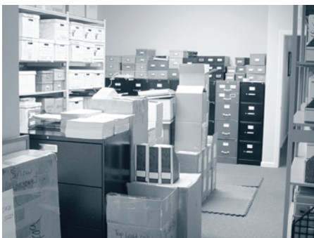
New Storage Room – Twice the Size and Already Full!