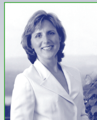
Dawn Upshaw, Soprano

Gaylord Opryland Resort and Convention Center, Nashville, Tennessee