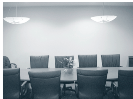
The New Conference Room Seats 10

There are more exciting changes on the way. Hold onto your hats, because 2007 is going to be a banner year for the National Association of Teachers of Singing!