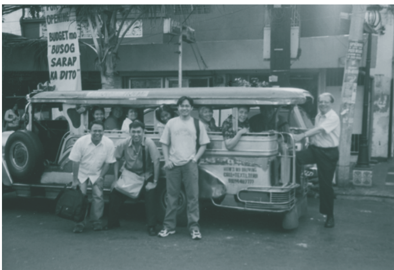
A post-meeting celebration aboard jeepney in Manila.

larger than New Zealand. English is the official language but one may encounter 111 linguistic, cultural and racial groups who speak Filipino, the national language based on Tagalog. In addition there are 70 languages and dialects that are also spoken. The country's history of Asian, Spanish and American influences have contributed to a rich and varied culture that is evident in architecture, music and language. I visited Manila in January having been invited to visit four schools, the 400 year-old University of Santo Tomas, the oldest in Asia, St. Scholastica's College, the University of the Philippines and St. Paul's University. All of these outstanding institutions have strong music programs with distinguished faculty members who have