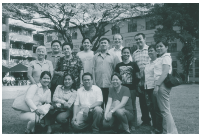
The founding members of the Philippine National Association.

There was a strong feeling among teachers that this was the time to come together to form a national association. Preliminary communications had been started before my arrival and the first meeting was held on January 16. An eager group of teachers and students met at St. Scholastica's College and formally launched P-NATS. Since that time there has been a second meeting and interest and enthusiasm is growing rapidly. Many of our ICVT colleagues and NATS members sent messages of support and congratulations as P-NATS replaced Iceland's FIS as the newest association. This title was short-lived for when I returned home I received notice that there is now an association in Spain, the ASOCIACIÓN ESPAÑOLA de PROFESORES de CANTO (AEPC). For information there is a web site: www.aepc.com.es . We now have 22 nations represented in the ICVT.