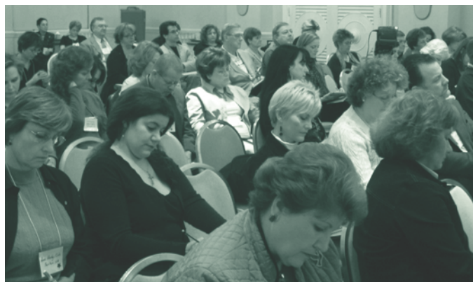
Workshop Attendees in Session