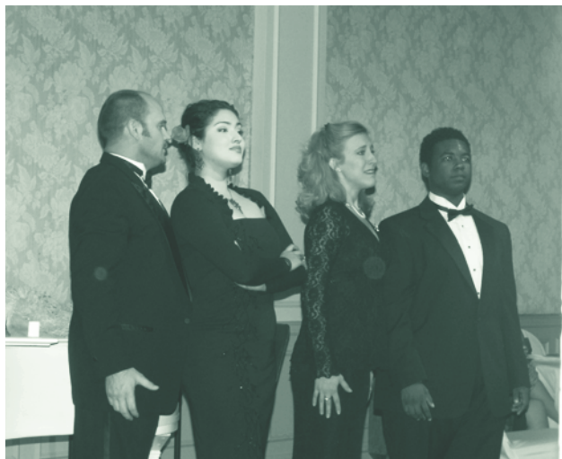
UTSA Students Provided Entertainment at Banquet